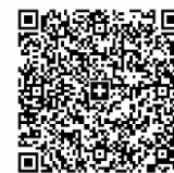
Digital IBAN QR-Code

Donations for the LCOC project are forwarded by the Lazarus Order Liechtenstein without deductions.